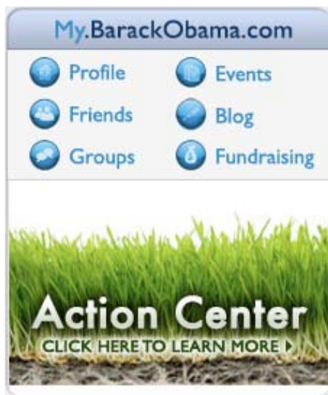
BSD makes community engagement easy for Barack Obama's supporters.

Obama for America is using the BSD Online Tools Suite to build and manage a sophisticated fundraising and constituency development operation on the Web in support of Senator Obama's Presidential campaign.