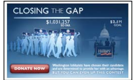
"Donate" buttons throughout the site lead to customizable contribution pages.