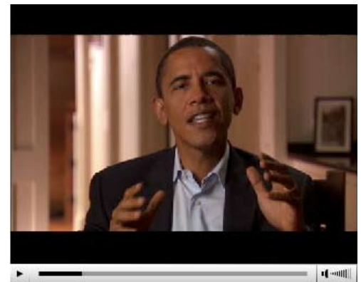
Video integrates seamlessly into pages.